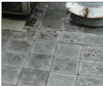
Asbestos cement tiles on a roof