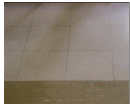
Interior floor tiles