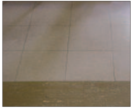
Interior floor tiles