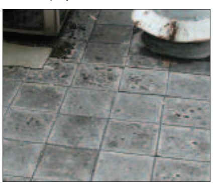
Asbestos cement tiles on a roof